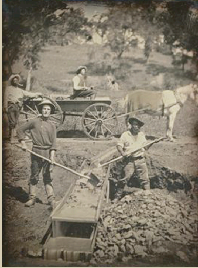
Spanish Flat, California, 1871. (Disqueereotype).