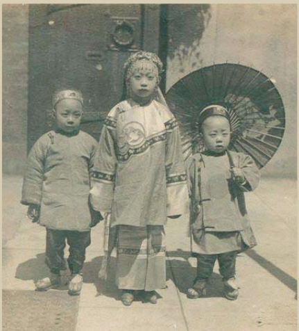
Three young Chinese children dressed for Moon dinner, circa 1915.