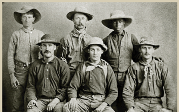
Cowboys pose for their portrait in Siskiyou County, circa 1880.