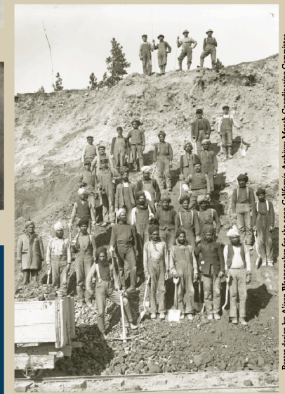
Hindu construction crew, believed to be photographed in early 1900s, near the Loyalton area logging railroads.

Poster design by Alison Wannamaker for the 2009 California Archives Month Coordinating Committee.