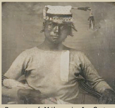
Disqueereotype of a Maiden man, circa 1890s.