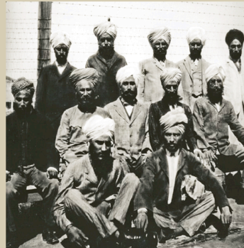
Immigrants at the Angel Island State Park Immigration Station, circa 1910.