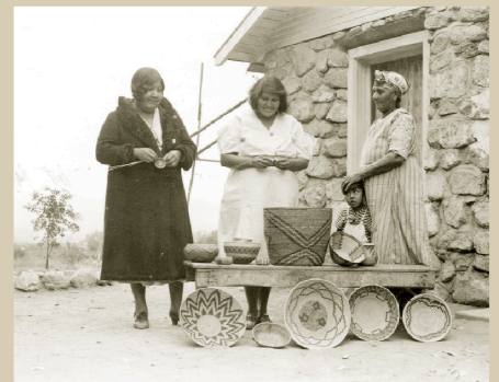
San Manuel women with baskets, circa 1938.