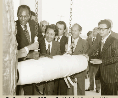
First Gong at the Korean Bell Tower at Fort MacArthur in Los Angeles with Mayor Tom Bradley and Congressman Glenn Anderson, 1976.