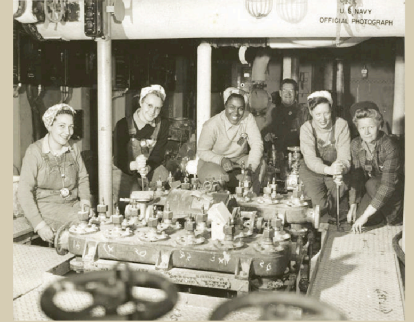
Female ship fitters, often embodied in "Rosie the Riveter" images, at Mare Island Naval Shipyard, 1945.