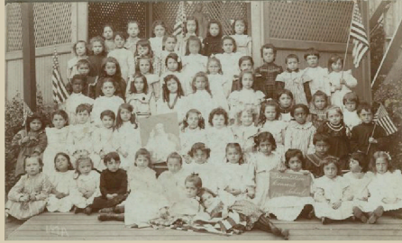
Students of the Presentation Convent School at Powell and Lombard Streets in San Francisco, 1904.