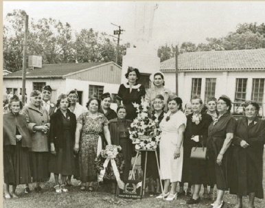
Madres de la Guerra (War Mothers) in front of the statue honoring Mexican World War II veterans at Centro Mexicano, 1949.