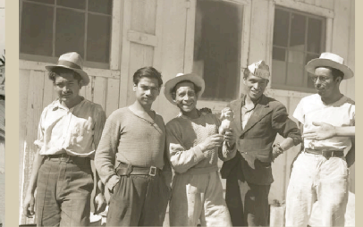
Five Mexican workers in front of camp building at unknown location, 1942.