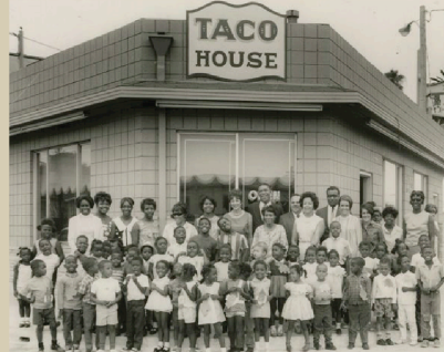
California State Senator Bill Greene (back row center) with schoolchildren, teachers, and staff in front of local landmark Bill's Taco House in Los Angeles, circa 1960s.

— VISIT — www.archivesmonth.org FOR INFORMATION ON ARCHIVES MONTH EVENTS IN CALIFORNIA